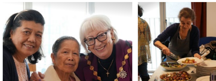
The Lord Mayor of Westminster meets Daventry House residents as lunch is enjoyed.

T he Daventry House lunch was the first time residents could all get together in their new lounge. The space has been designed for residents to socialise, with a reading area and kitchen. From the lounge, residents can also make use of a garden terrace with planting and seating. We wish residents many happy years ahead in their new homes.