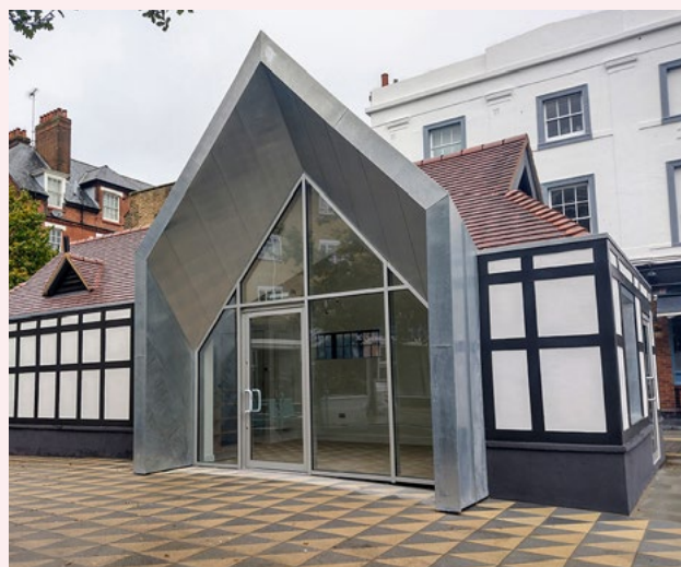
The refurbished building will host a new community cafe and public toilet facilities.