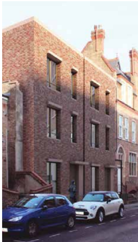
New homes at Ashbridge, Ashmill and Cosway