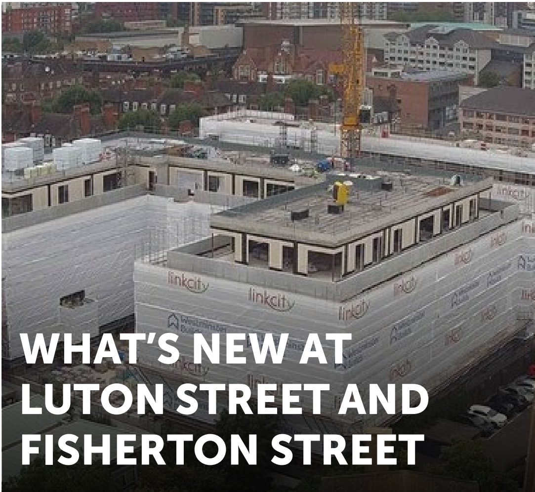
A progress picture of Luton Street

W elcome back to the Luton and Fisherton Street newsletter, keeping you up to date with what's happening with the development. The main structure, including the three town houses on Fisherton Street, is now complete. The team are now focused on the completion of the roof coverings, brick work and the fit-out of the new homes including the mechanical and electrical equipment to provide sustainable heat, hot water and power.