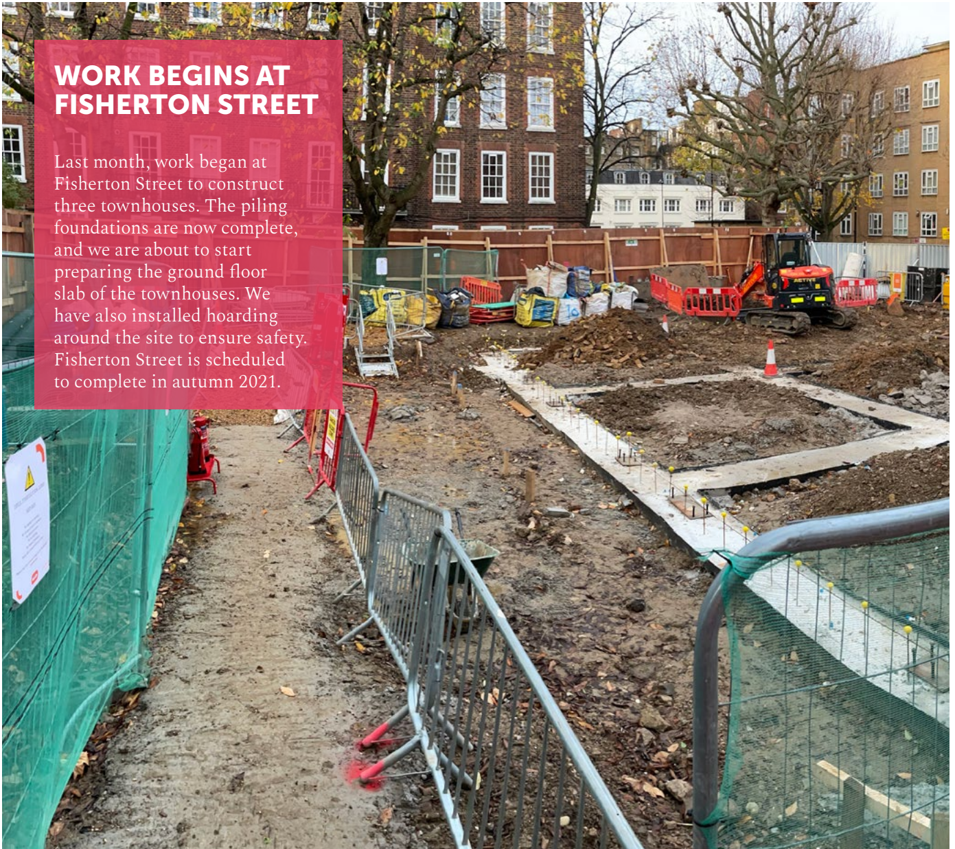
Photograph showing progress in preparing the foundations for townhouses at Fisherton Street

Last month, work began at Fisherton Street to construct three townhouses. The piling foundations are now complete, and we are about to start preparing the ground floor slab of the townhouses. We have also installed hoarding around the site to ensure safety. Fisherton Street is scheduled to complete in autumn 2021.