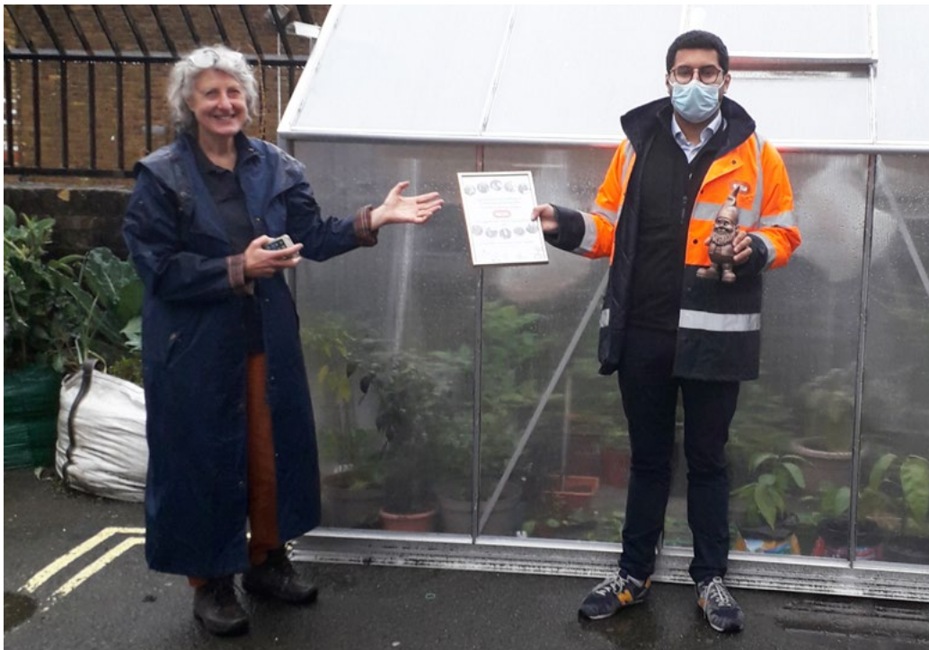
The greenhouse built for the Fisherton Street Garden Project

The Fisherton Street Garden Project is funded by the Church Street Neighbourhood Keepers Programme, which provides support to community activities in and around Church Street. The Neighbourhood Keepers team would like to thank Sergio and Grigor for the excellent assistance they have provided to Cherifa and the Fisherton Street Garden Project in building the new gardening facilities, which will benefit the community for many years to come.