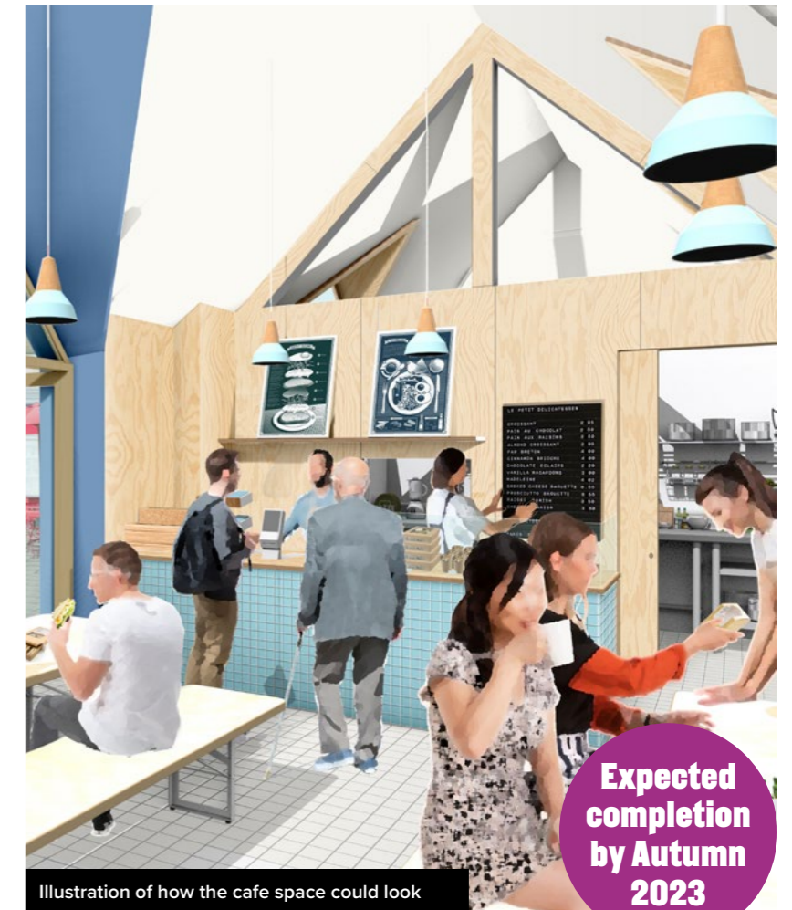
Illustration of how the cafe space could look