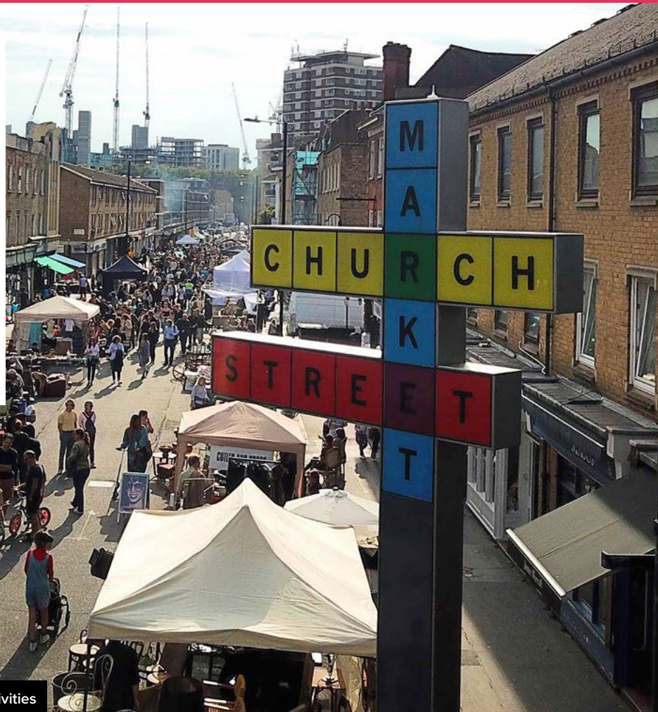
Church Street will continue to host popular events and activities

A s we start looking ahead, we are excited what's to come for Church Street in 2023. From completion of new affordable homes, improvements to public spaces, and bringing you community events, find out some of the latest highlights across Church Street on page 3. We wish everyone in the community a happy year ahead.