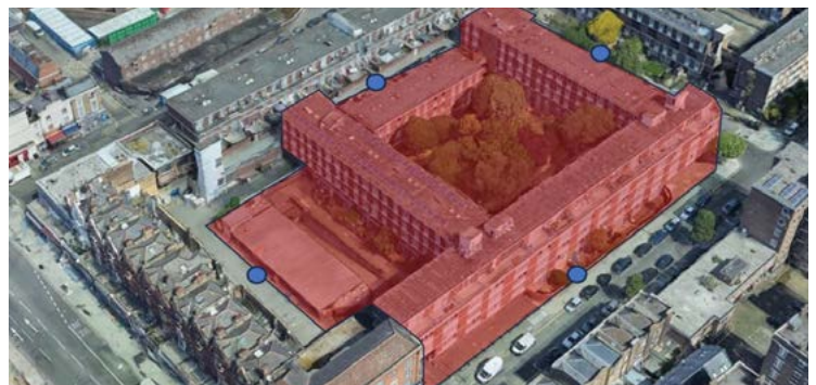
Map of Site A, Blue markers indicates proposed locations of noise and dust monitors.

Data will be continuously recorded and a site manager will be recording and monitoring alerts. These measures would be based on the Mayor's Best Practice Guidance (The Control of Dust and Emissions from Construction and Demolition).