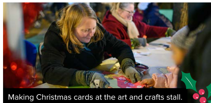
Making Christmas cards at the art and crafts stall.