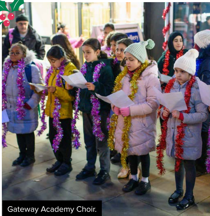
Gateway Academy Choir.