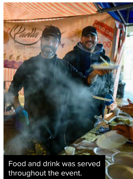
Food and drink was served throughout the event.