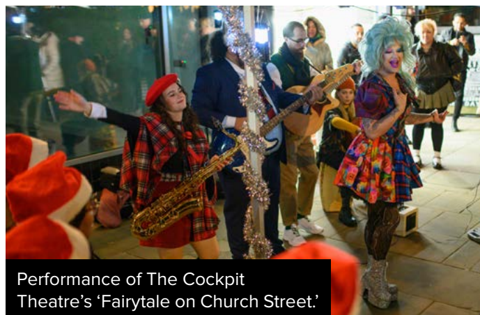
Performance of The Cockpit Theatre's 'Fairytale on Church Street.'