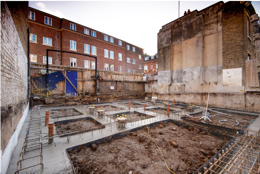
A progress picture of Ashmill Street

BRINGING YOU THE LATEST FROM THE ASHBRIDGE, ASHMILL AND COSWAY STREETS PROJECT, WHICH IS PART OF THE CHURCH STREET REGENERATION PROGRAMME