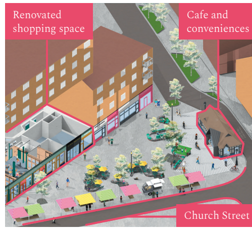
The Church Street Triangle project

We will continue to provide updates on the project as it develops, including on a future cafe operator and the shops which are yet to be appointed. Please do not hesitate to contact us for more information or visit the Regeneration Base.