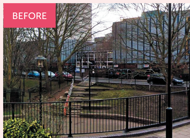
A renewed seating area that can now host events