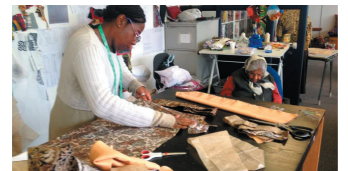
WEPT offers training courses and workshops