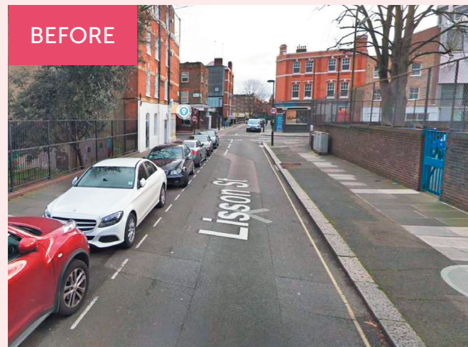
Out with cars and in with new paving and play equipment along Lisson Street