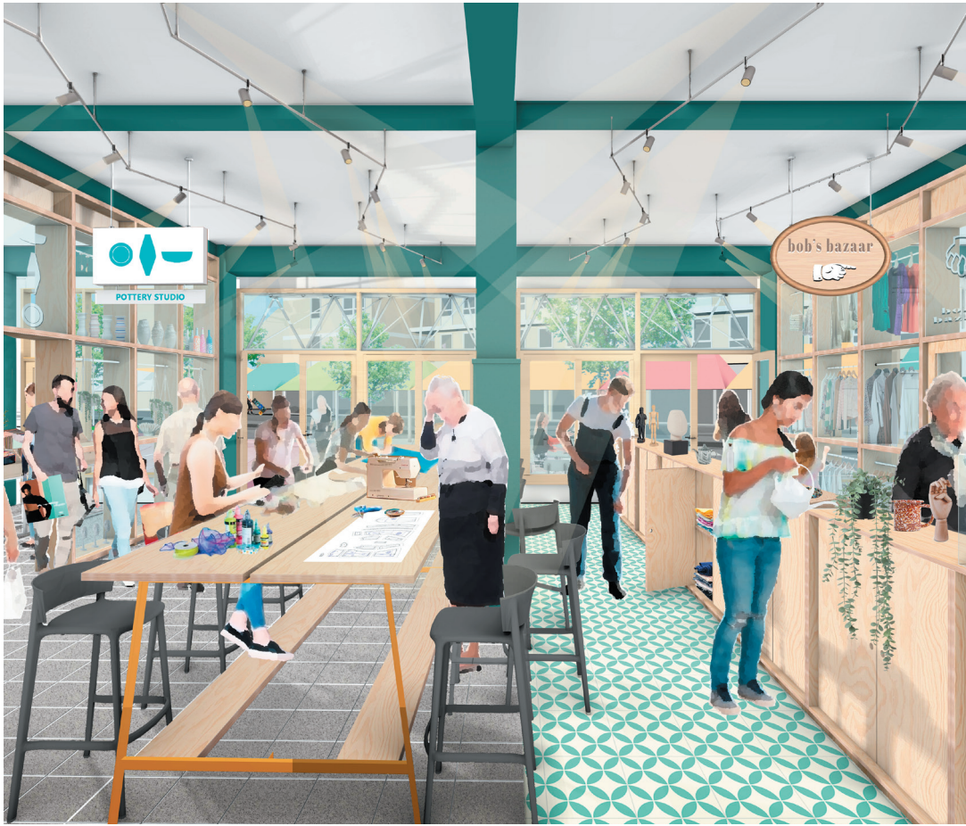
Expected this year: sketch of how the new shopping spaces could look at the Church Street Triangle