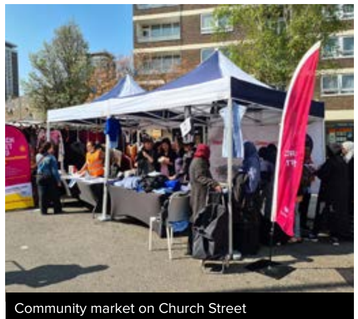
Community market on Church Street

The market takes place on the third Thursday each month starting on 21 March from 10.30am to 2.30pm. Check out our Facebook page at facebook.com/mychurchstreet for updates. If you would like to take part in one of these market events, please email churchstreet@westminster.gov.uk