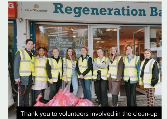
Thank you to volunteers involved in the clean-up

If you would like to volunteer on future events, including gardening opportunities contact us at churchstreet@westminster.gov.uk or call on 020 7641 2968 .