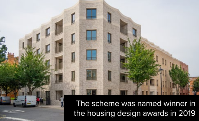
The scheme was named winner in the housing design awards in 2019

Throughout September we welcomed the residents formerly of Penn House to their new home at Daventry House. If you walk along Lisson Grove, you will notice that the hoarding has now been removed from the pavement and over the coming months, new paving will be laid, a bus stop reinstated and new trees will also be planted along the street.