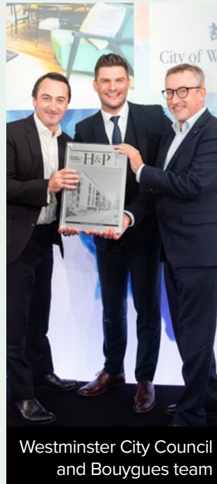
Westminster City Council and Bouygues team

On Friday 29th September, Westminster City Council was awarded the 'Highly Commended Award' by Evening Standard for a Large Development for Fisherton Street and Church Street Community Sports Centre. The award is in recognition for all those involved in the project. Well done!