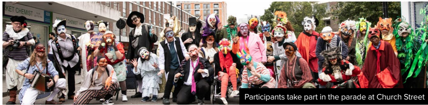
Participants take part in the parade at Church Street