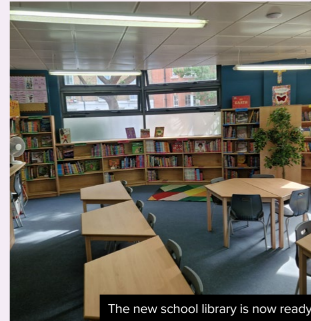
The new school library is now ready

Where: Courtyard in front of Ravensbourne House, Broadley Street, NW8 8BE