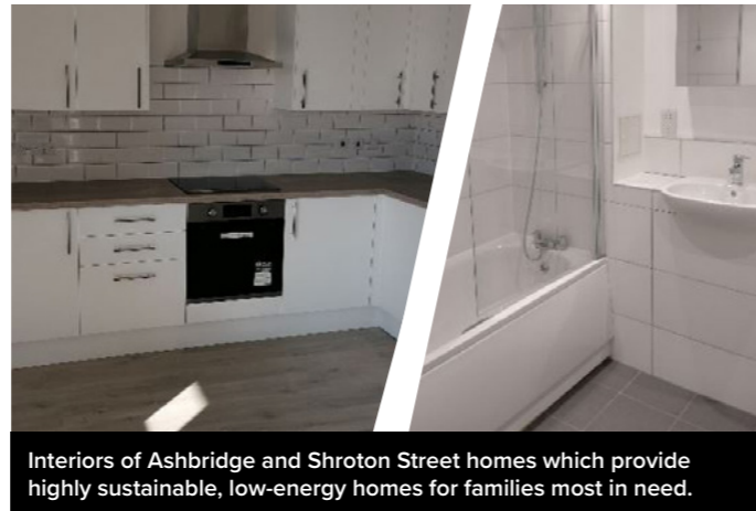
Interiors of Ashbridge and Shroton Street homes which provide highly sustainable, low-energy homes for families most in need.

26 homes are being built at Ashbridge Street, whilst two townhouses at Shroton Street are now occupied by families. All of these homes are at social rent levels.