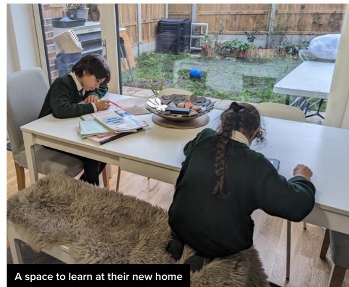
A space to learn at their new home