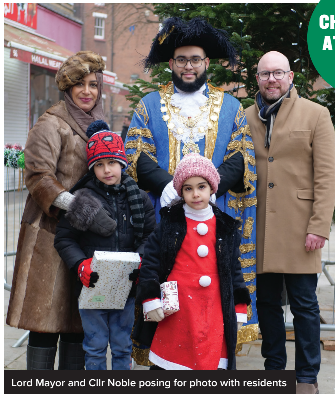
Lord Mayor and Cllr Noble posing for photo with residents