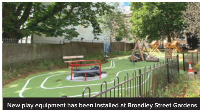
New play equipment has been installed at Broadley Street Gardens