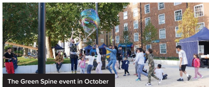
The Green Spine event in October