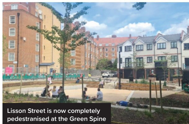
Lisson Street is now completely pedestrianised at the Green Spine

We look forward to keeping you updated on the continued progress of projects and community events at Church Street in our future editions of the newsletter and on our website churchstreet.org