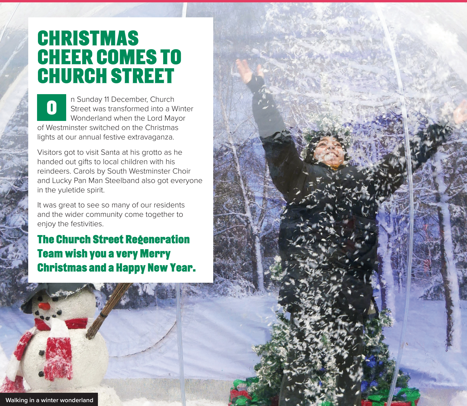
Walking in a winter wonderland

The Church Street Regeneration Team wish you a very Merry Christmas and a Happy New Year.