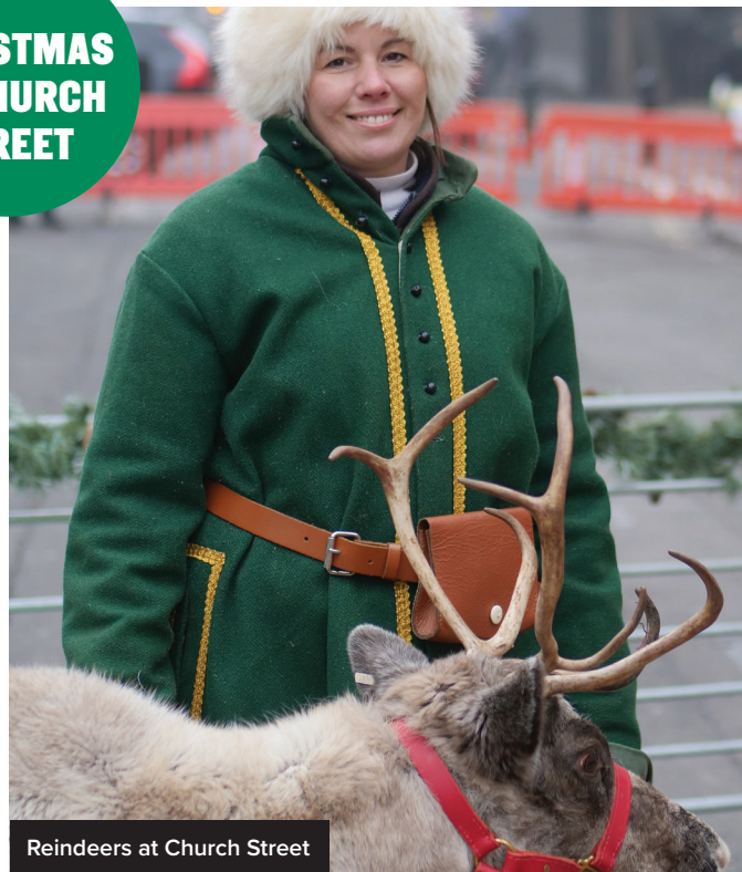
Reindeers at Church Street