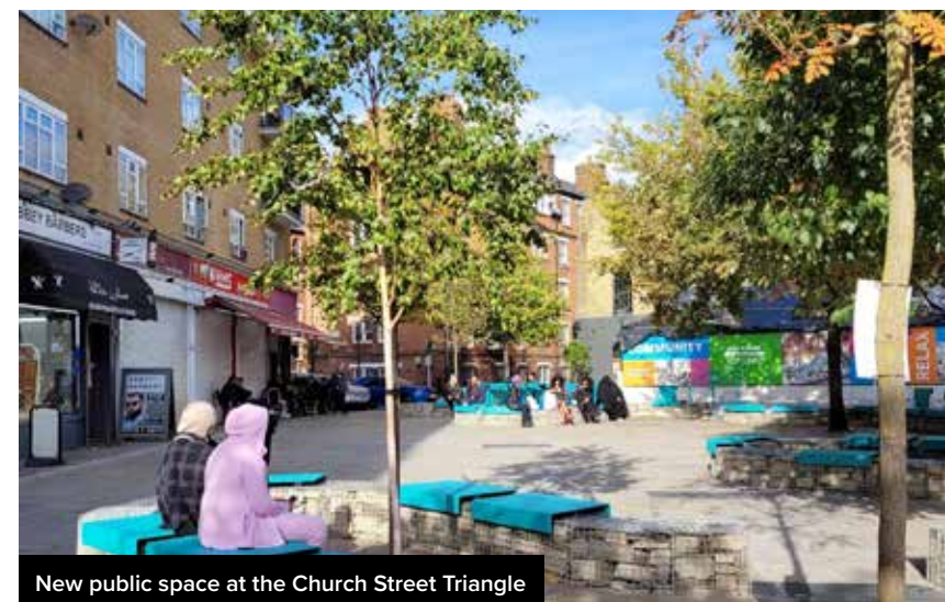
New public space at the Church Street Triangle