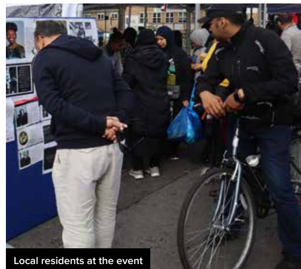
Local residents at the event

R esidents at the Church Street Market were treated to food stalls with a Caribbean flavour and the history of some of the pioneers in their field from the Windrush Generation. To find out more about how our residents help shape Westminster, you can visit the Windrush Generation – Unsung Hero's exhibition at City Hall, 64 Victoria Street until 12 December or contact windrush@westminster.gov.uk