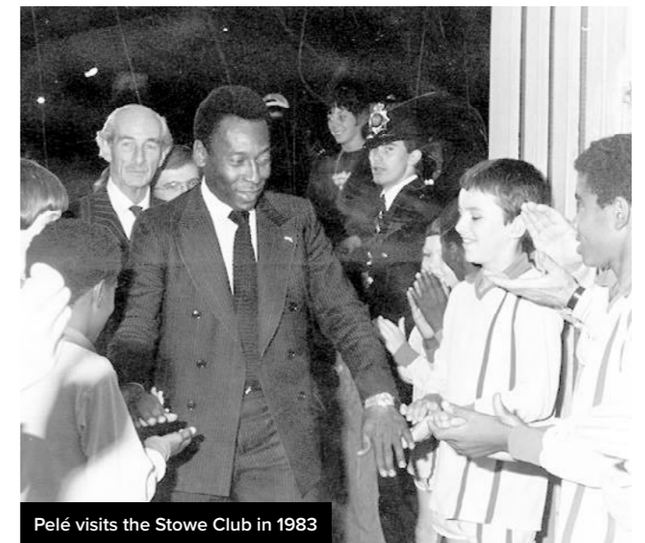
Pelé visits the Stowe Club in 1983