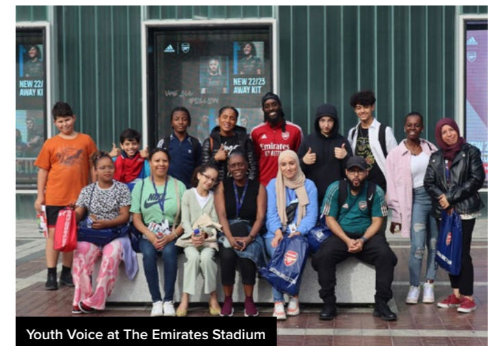
Youth Voice at The Emirates Stadium

For more information about Church Street Youth Voice, visit our website at churchstreet.org or you can contact us at churchstreet@westminster.gov.uk