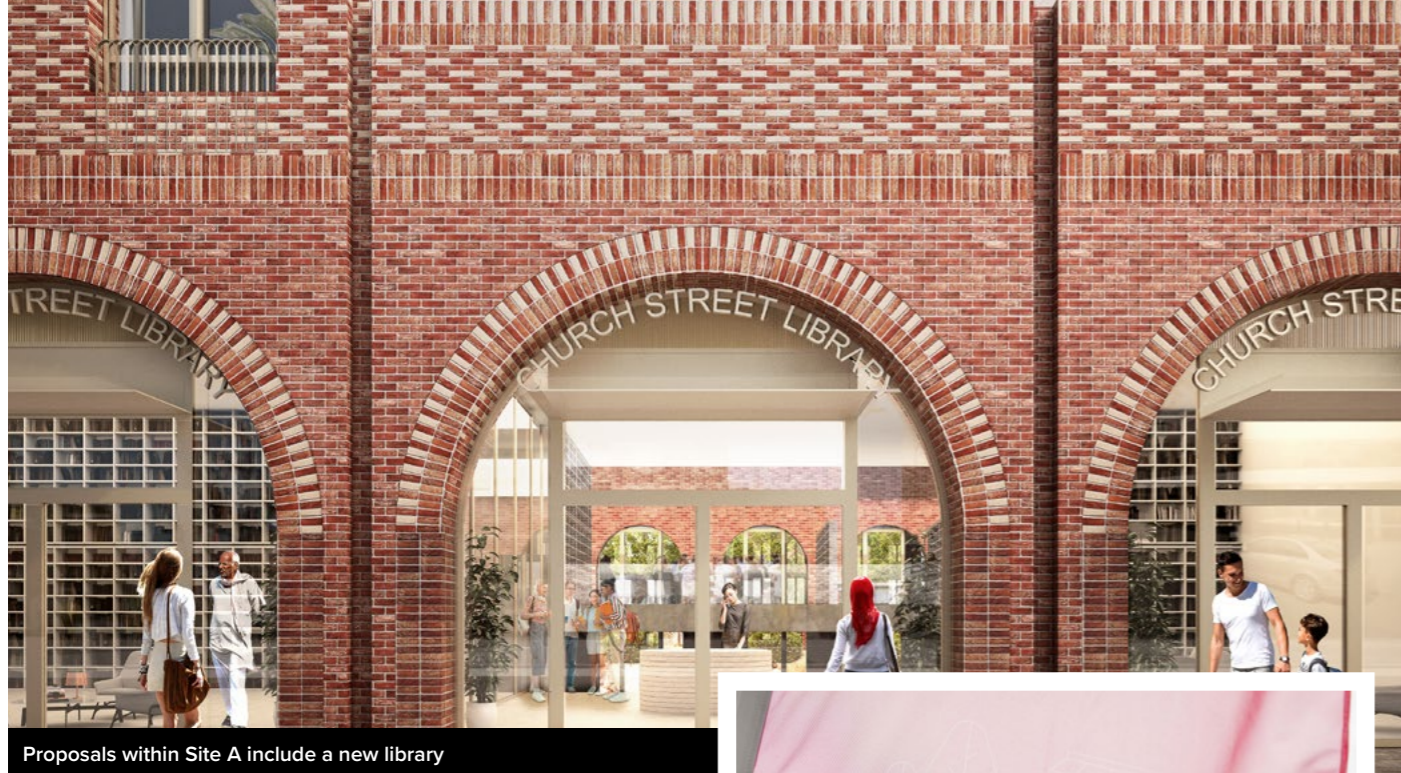
Proposals within Site A include a new library