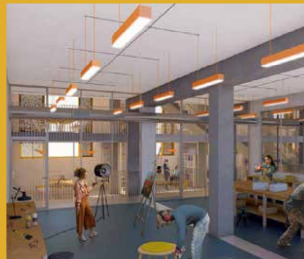
Sketches showing how the new enterprise could look, containing both open plan and contained office spaces for hire