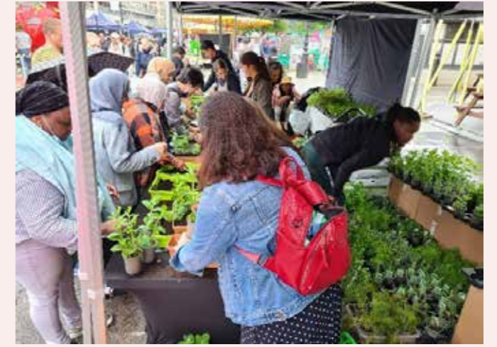
Bringing communities together with the activities on offer

Residents and community groups came together for a day of fun and activities including planting, a bouncy castle and Ferris wheel as well as face painting and food stalls. The event was organised by HAFS academy, part funded by Neighbourhood Keepers Programme which provide funds for local people to deliver positive and healthy events by and for the community. To find out more about Neighbourhood Keepers Programme, visit churchstreet.org/neighbourhood-keepers-programme