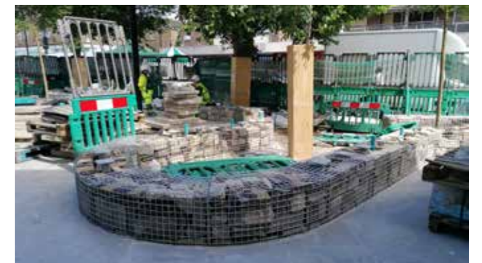
New play equipment, pergolas and planting at Broadley Street Gardens and gabion seating being constructed at the Church Street Triangle