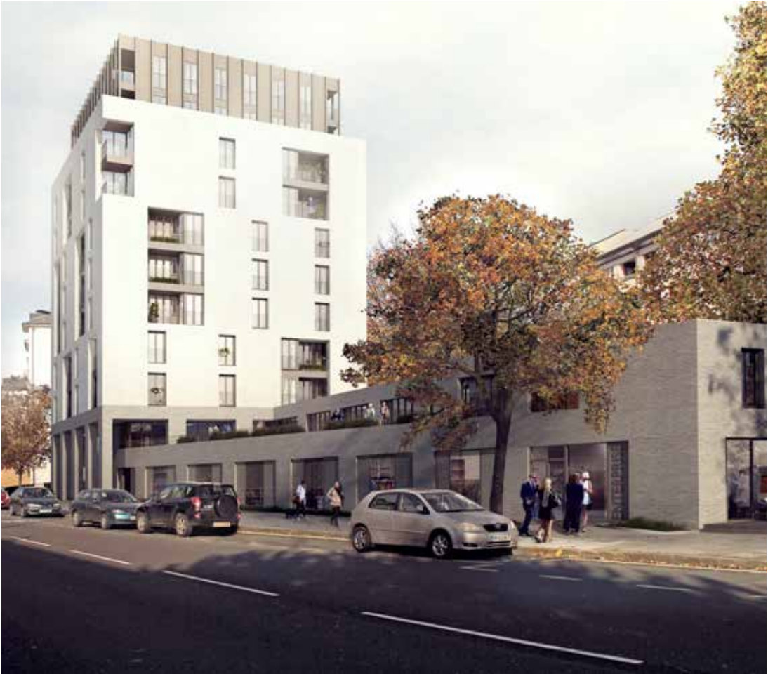
Lisson Arches will include 60 community-supported homes and enterprise space

BRINGING YOU THE LATEST NEWS FROM THE NEIGHBOURHOOD OF CHURCH STREET