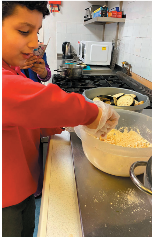
New healthy recipes are aplenty at Desi Lunchbox

Further cookery class dates will be planned shortly. If you would like to get involved or find out more please contact neighbourhoodkeepers@westminster.gov.uk