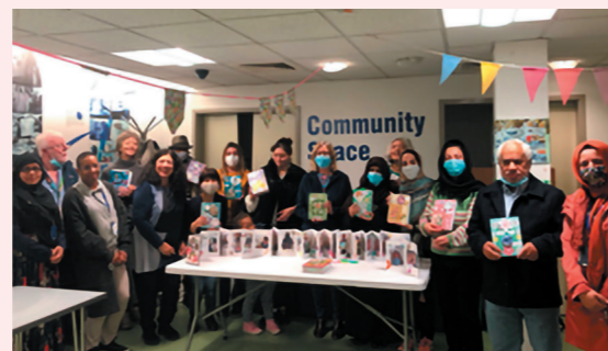
Residents celebrate their work at the Church Street Library

An exhibition of the works is being planned for the new year. We'd like to thank everyone who took part in the project which was funded by the Neighbourhood Keepers programme.