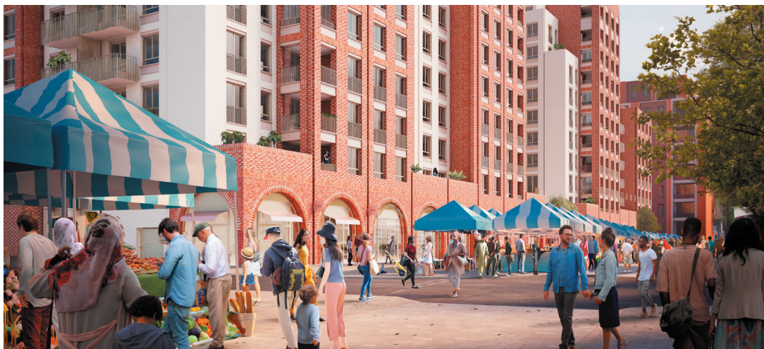
An illustrative view of Site A with the Church Street Market in the foreground

BRINGING YOU THE LATEST NEWS FROM THE NEIGHBOURHOOD OF CHURCH STREET