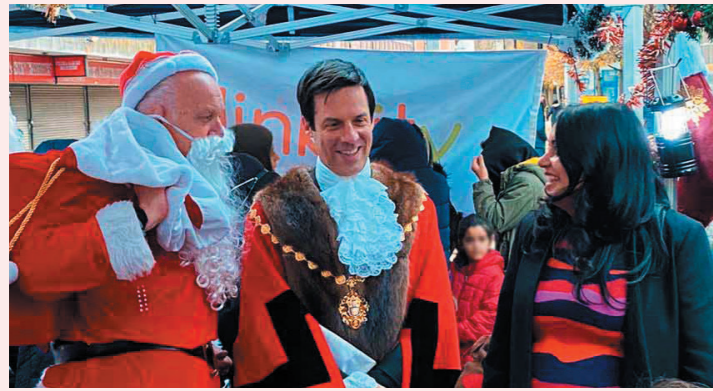
The Lord Mayor attended Church Street for the Christmas light switch-on

Visitors enjoyed festive food and drinks while they created Christmas wreaths with our Youth Market and listened to carols sung by Gateway Academy Choir, South Westminster Community Choir and the Penfold Dementia Choir. There may have even been an early visit from Santa to hand out presents. Thank you to all who joined, it was great to see residents come together for a fantastic community event at this special time of the year.