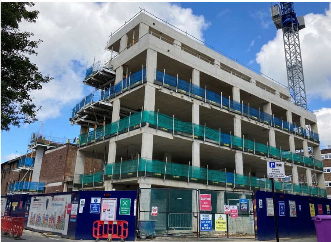
Progress at the Ashbridge Street site