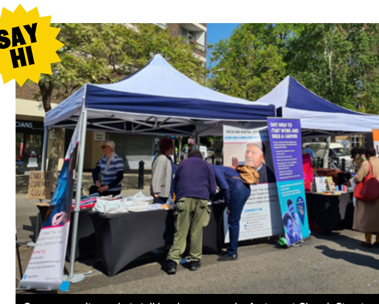
Our community market stall has been a regular feature at Church Street.

The community market takes place on the 3rd Thursday each month. Check out our Facebook page at facebook.com/mychurchstreet for updates. The next event will be on Thursday 16 March, 10am to 3pm.