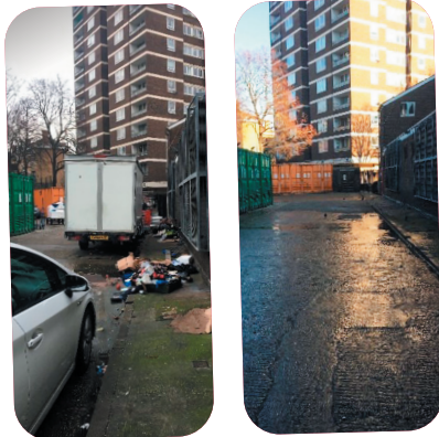
Recent cleaning at Venables Yard, please do your part to keep the area tidy

We are currently working on a solution to prevent noise disturbance from an item of play equipment that has been reported on the Green Spine to nearby residential properties. We thank you for your patience while we address this issue and we will keep residents updated on progress.