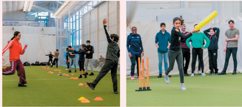
Howzat for a day out? The Youth Voice are put to the test at Lord's