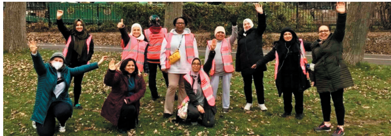
The Westminster Women's Cycling group