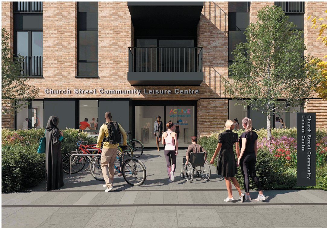
Your new Church Street Community Leisure Centre will be open to all as part of the Luton Street development project

BRINGING YOU THE LATEST NEWS FROM THE NEIGHBOURHOOD OF CHURCH STREET